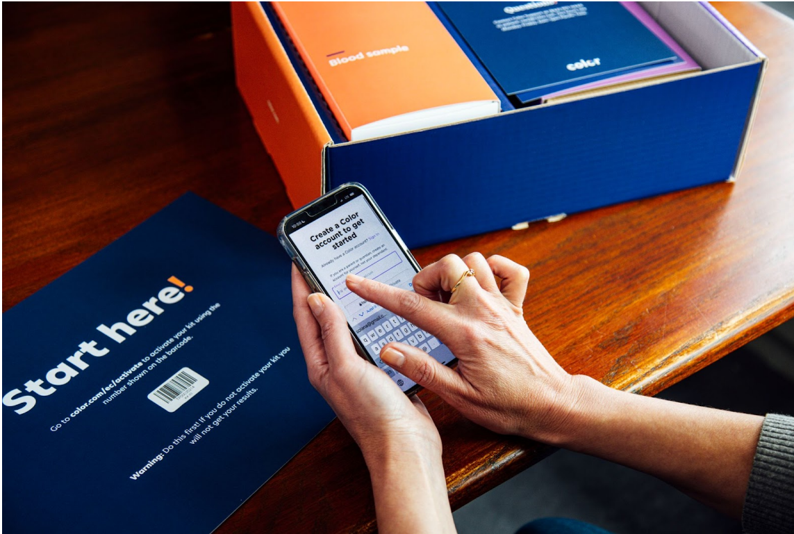
Above image: Individual creating an account with Color before using the cardiovascular disease prevention and screening kit